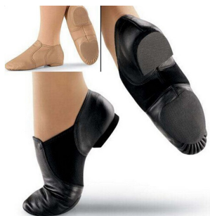
Contemporary Jazz shoes